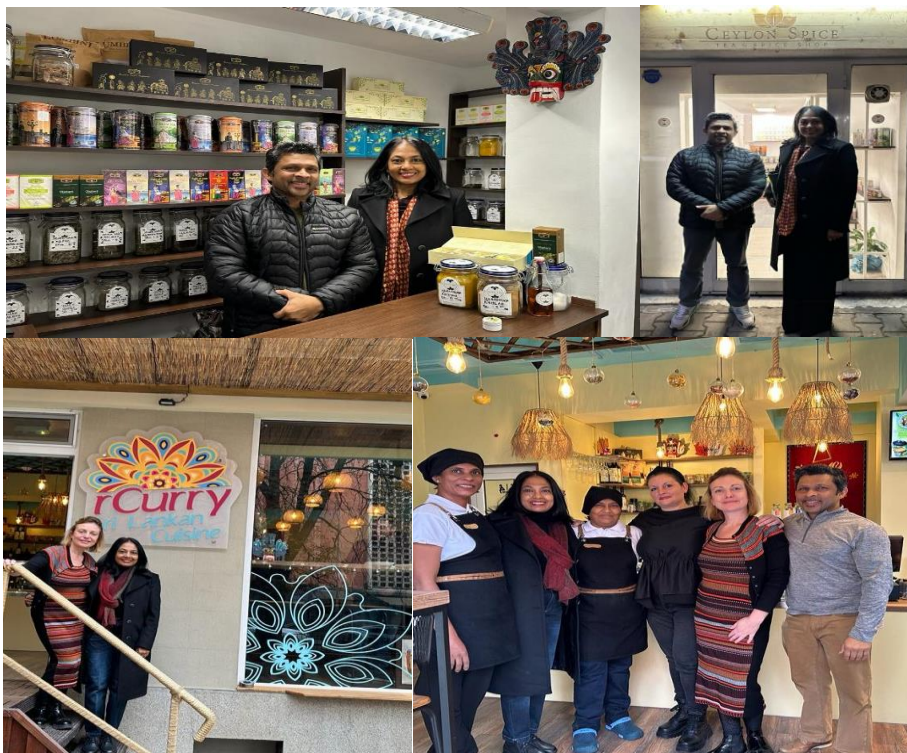
Visiting the Sri Lankan businesses in Sofia