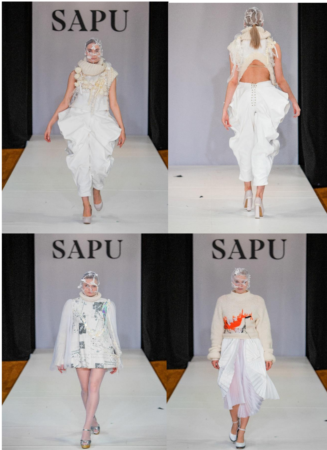
Natharlea's 'The Poison' alpaca yarn/birds'feathers knitwear collection on the ramp at the CFW 2022

Inspired by the tallest tree and the brightest orchid in the Amazon rainforest and, conscious of the ever increasing and damaging assaults on mother nature, her collection featured at the CFW 2022, was all about ecological preservation, regeneration, renewal and sustainability. Hand crafted garments, using factory leather waste as material, and alpaca yarn and birds' feather for the knit wear, the young designer's extraordinary artistry was all about up-cycling and up-styling. The Sri Lankan sensibility was subtly captured in the elegant creations that were presented.