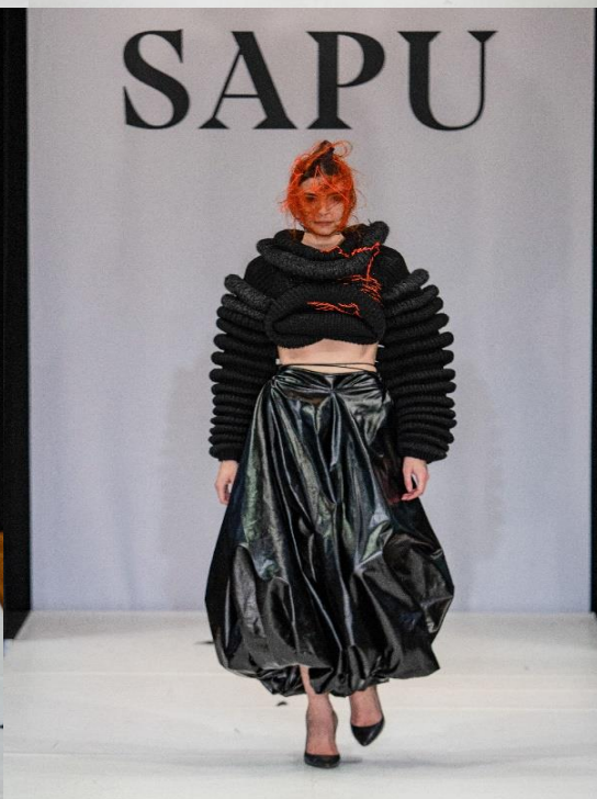
Natharlea's knit and recycled leather- "The Poison" collection - on the ramp at the CFW 2022