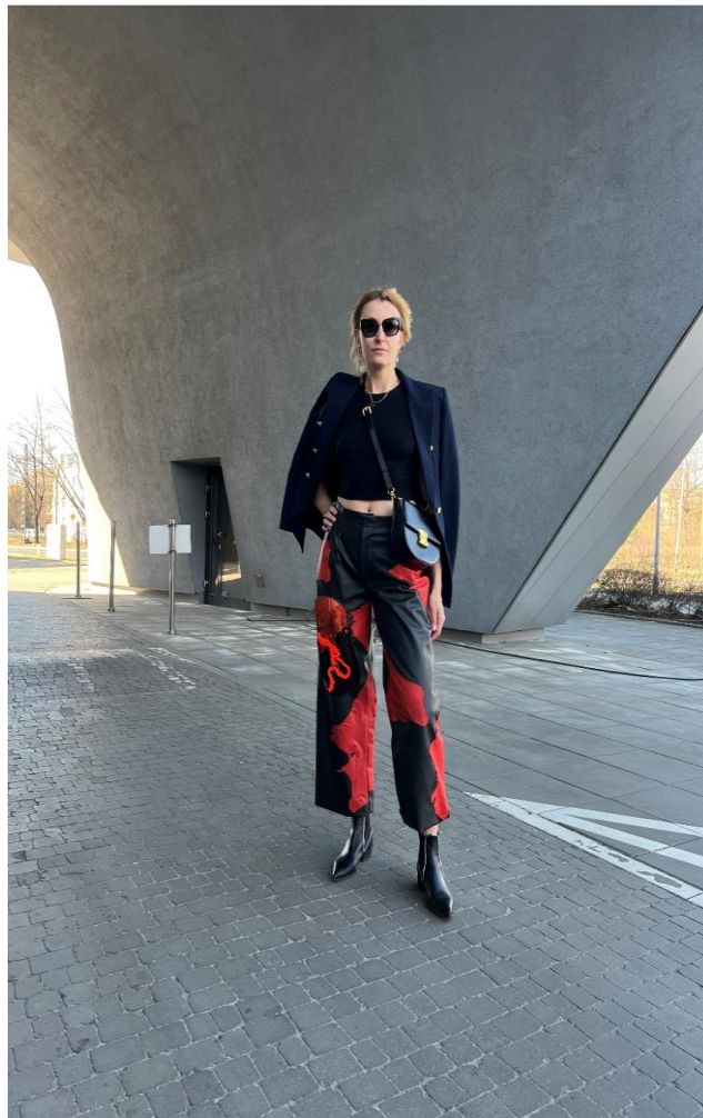
A Cracow fan of "The Poison Collection"